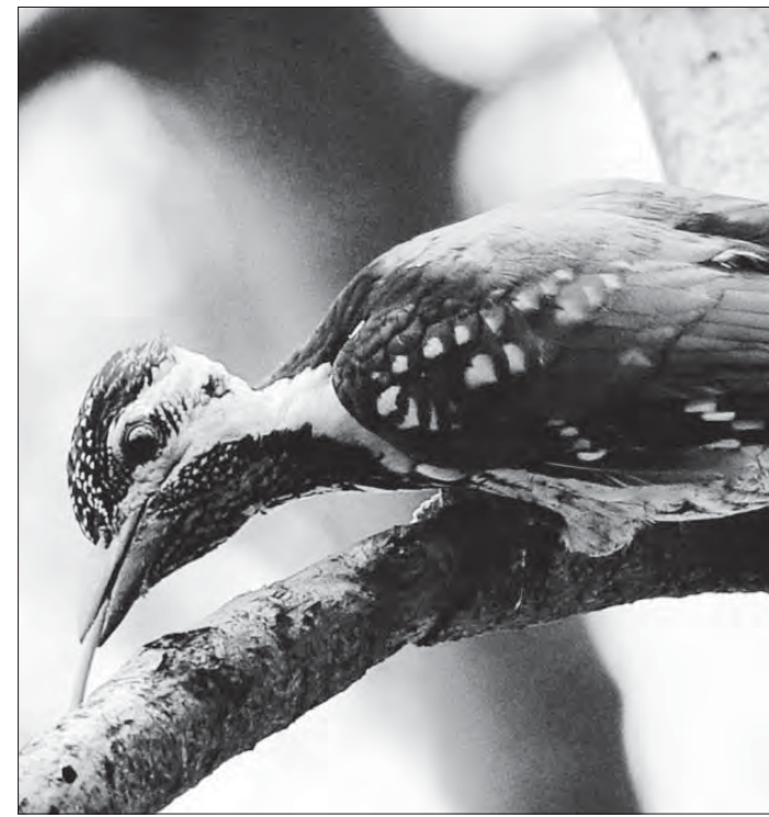
'FOWL' IS FAIR AND FAIR IS 'FOWL' ~ A black-rumped Flameback woodpecker (Dinopium Benghalense) eats an insect in Guwahati on Saturday.