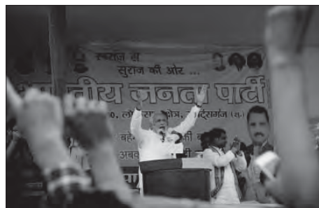
Narendra Modi in Robertsganj on Saturday.

The BJP chief said as there was still time for his term as party chief to end, he would not want