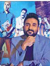
Kangana Ranaut and co-actor Vir Das visited Wave Cinemas, Noida, to promote their new film Revolver Rani .