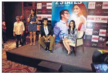
Arjun Kapoor and Alia Bhatt promoted their film, 2 States, at Dusit Devarana.