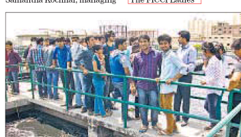
Students of KIIT College visited the sewage treatment plant in Sector 48, Gurgaon.