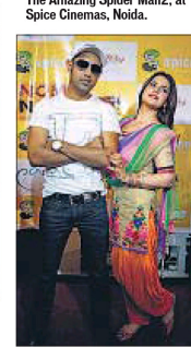
Punjabi singer Gippy Grewal and his Jatt James Bond co-star Zarine Khan promoted their film at Spice Mall, Noida.