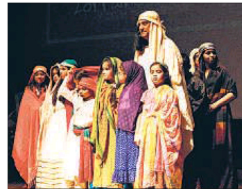
On the eve of Easter, the Lorraine Music Academy staged a musical, An Easter Tale at the Epicentre Auditorium.