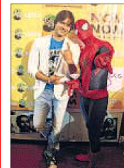
Actor Vivek Oberoi promoted, The Amazing Spider Man 2 , at Spice Cinemas, Noida.